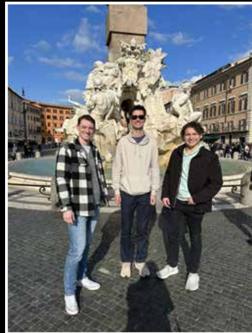
At left, above & below: Three Zeta architecture students studying abroad in Italy for one year.