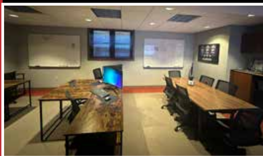
New Furniture Layout in Study Room fitted with individual computer stations, updated computers / monitors, and study table.