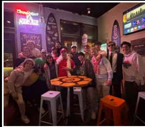
Our men during the Kappa Delta mixer.

I am very proud of the hard work being done by the men of Zeta chapter from the Seniors who want nothing more than to be done with their studies, to the Freshmen who are actively representing us in an amazing light on campus.