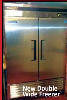
New Double Wide Freezer