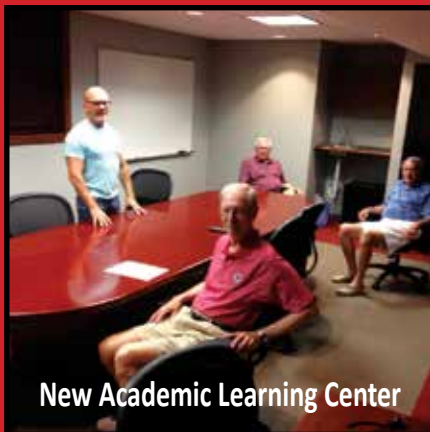
New Academic Learning Center

The photos on this page show many of the high dollar additions to the House as a result of your donations to the 5 year Capital Fund Drive. One item not shown that required almost 25% of all money spent is the new roof over the entire house. It was done in two phases, but within the 5 year period. We accomplished a lot with your donations, but we still have additional projects that need to be completed before we can finish the remodeling process that we began in 2014. We continue to have one of the top houses on campus.