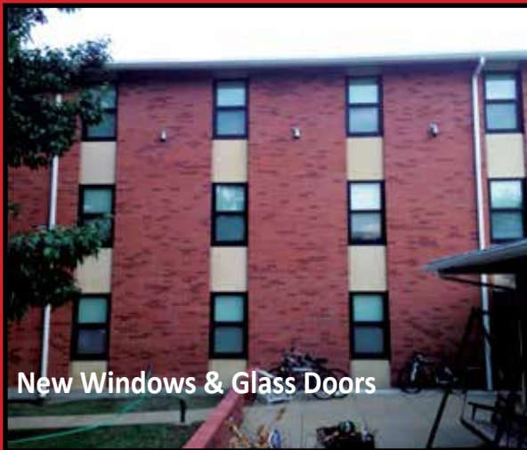
New Windows & Glass Doors