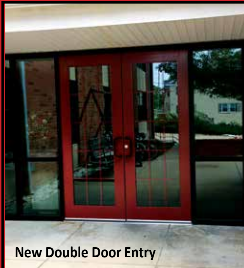
New Double Door Entry