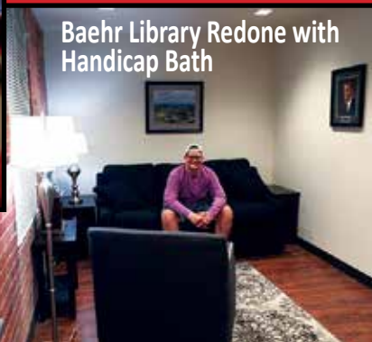
Baehr Library Redone with Handicap Bath