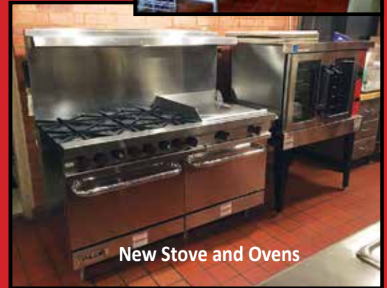
New Stove and Ovens