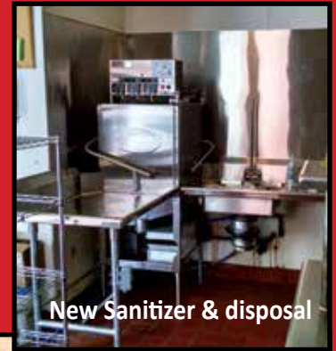
New Sanitizer & disposal

The kitchen received a new stove with separate ovens, a new double wide freezer, new ice making machine, new sanitizer (dishwasher & disposal), and a new double door refrigerator, plus much needed drain line clean-outs.