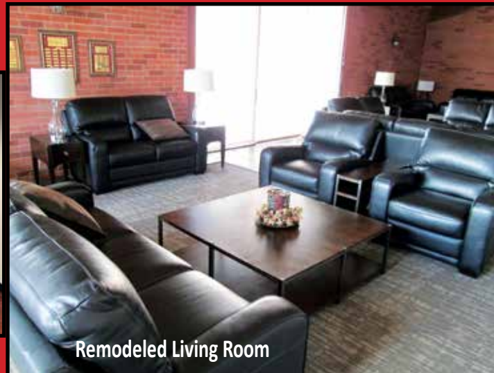
Remodeled Living Room